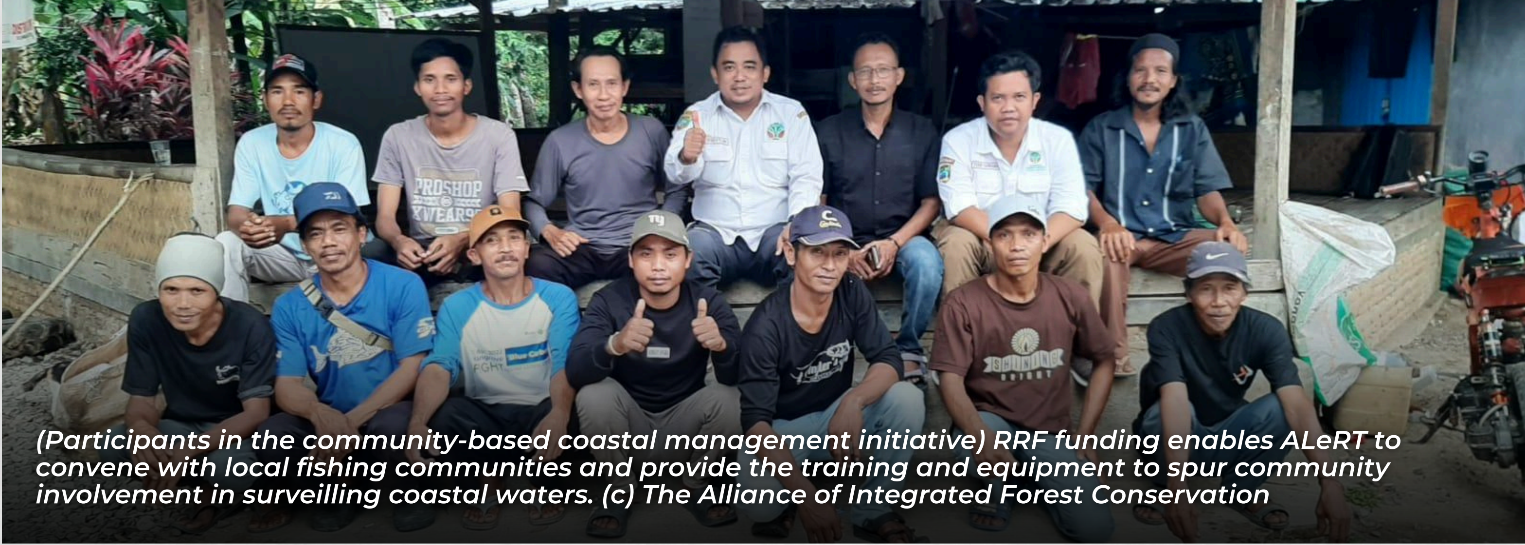
(Participants in the community-based coastal management initiative) RRF funding enables ALeRT to convene with local fishing communities and provide the training and equipment to spur community involvement in surveilling coastal waters.

pride and pro-rhino behaviors, building the grassroots commitment essential for long-term rhino protection.