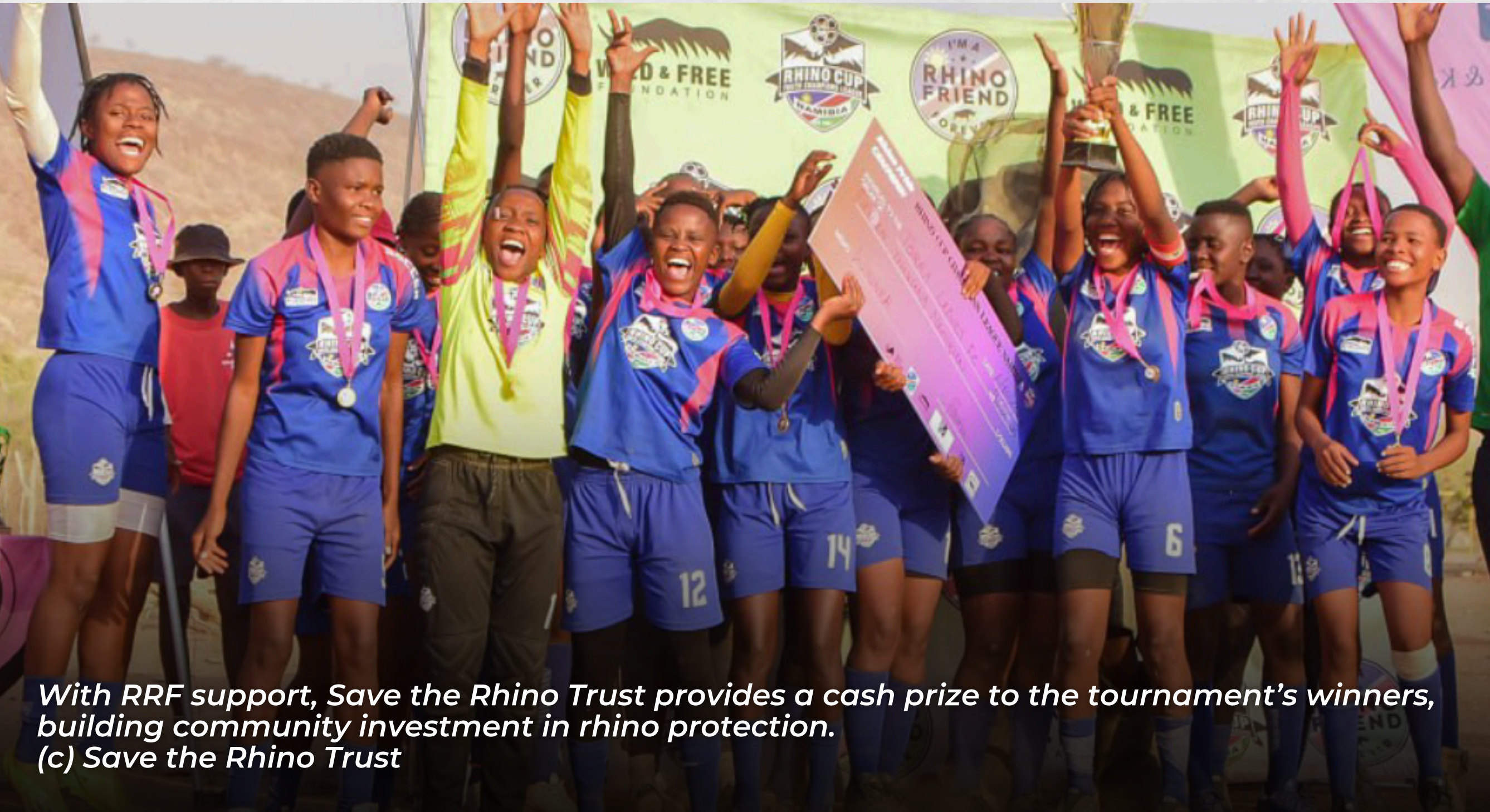
With RRF support, Save the Rhino Trust provides a cash prize to the tournament's winners, building community investment in rhino protection.

Namibia's Kunene Region is home to the world's largest free-ranging black rhino population, yet poaching pressures threaten their survival. In this vast and remote landscape, effective protection relies on strong community engagement. With their knowledge of the land and emerging threats, local communities can be key allies in rhino conservation. In 2022, Save the Rhino Trust launched the Rhino Cup Champions League, a community football tournament promoting positive attitudes toward rhinos. With support from the Rhino Recovery Fund, the program is expanding into the region's Etosha landscape, home to a high density of rhinos. By providing local relevance and conservation education through league events, the initiative fosters