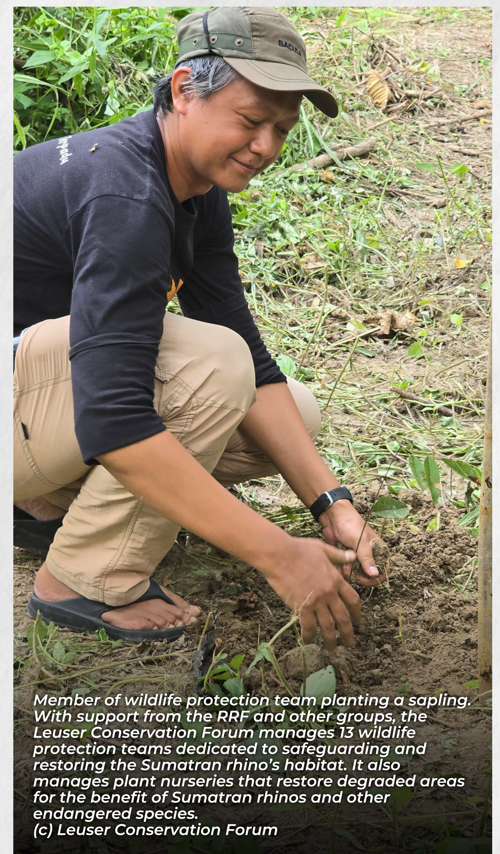
Member of wildlife protection team planting a sapling. With support from the RRF and other groups, the Leuser Conservation Forum manages 13 wildlife protection teams dedicated to safeguarding and restoring the Sumatran rhino's habitat. It also manages plant nurseries that restore degraded areas for the benefit of Sumatran rhinos and other endangered species.