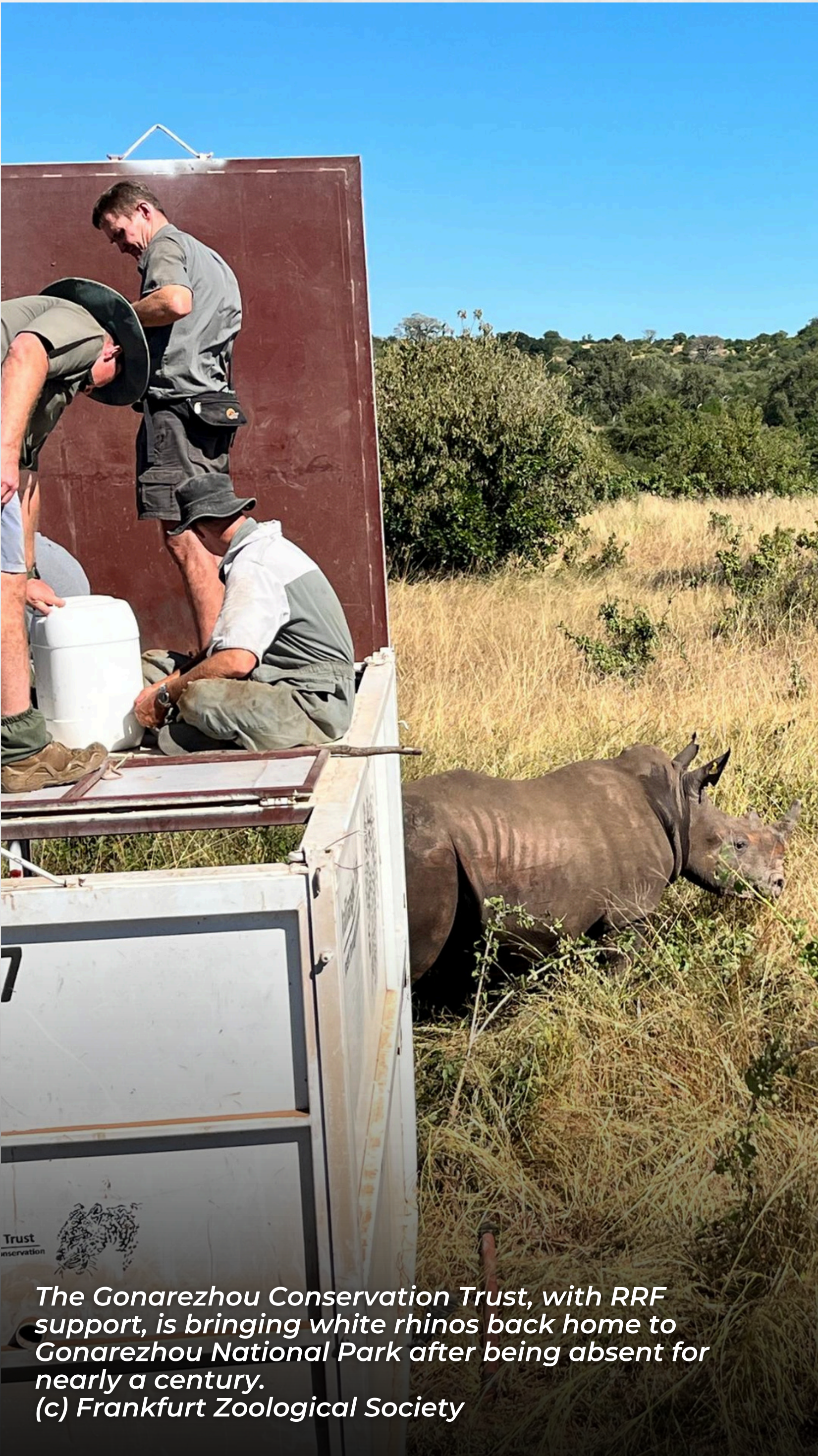
The Gonarezhou Conservation Trust, with RRF support, is bringing white rhinos back home to Gonarezhou National Park after being absent for nearly a century.

in GNP. This follows the RRF's support for the 2021 black rhino reintroduction in GNP, restoring both African rhino species to this park.