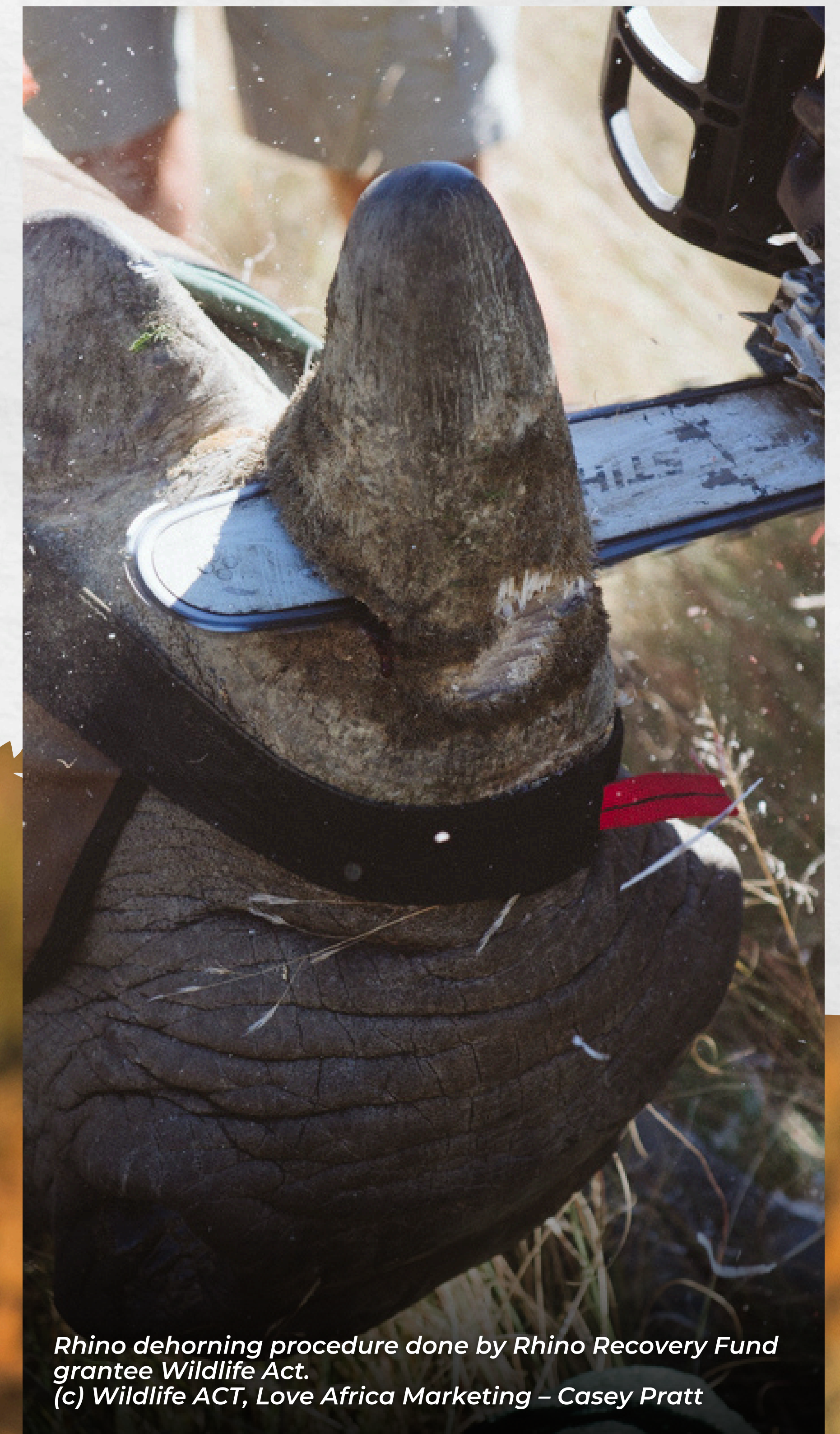
Rhino dehorning procedure done by Rhino Recovery Fund grantee Wildlife ACT.