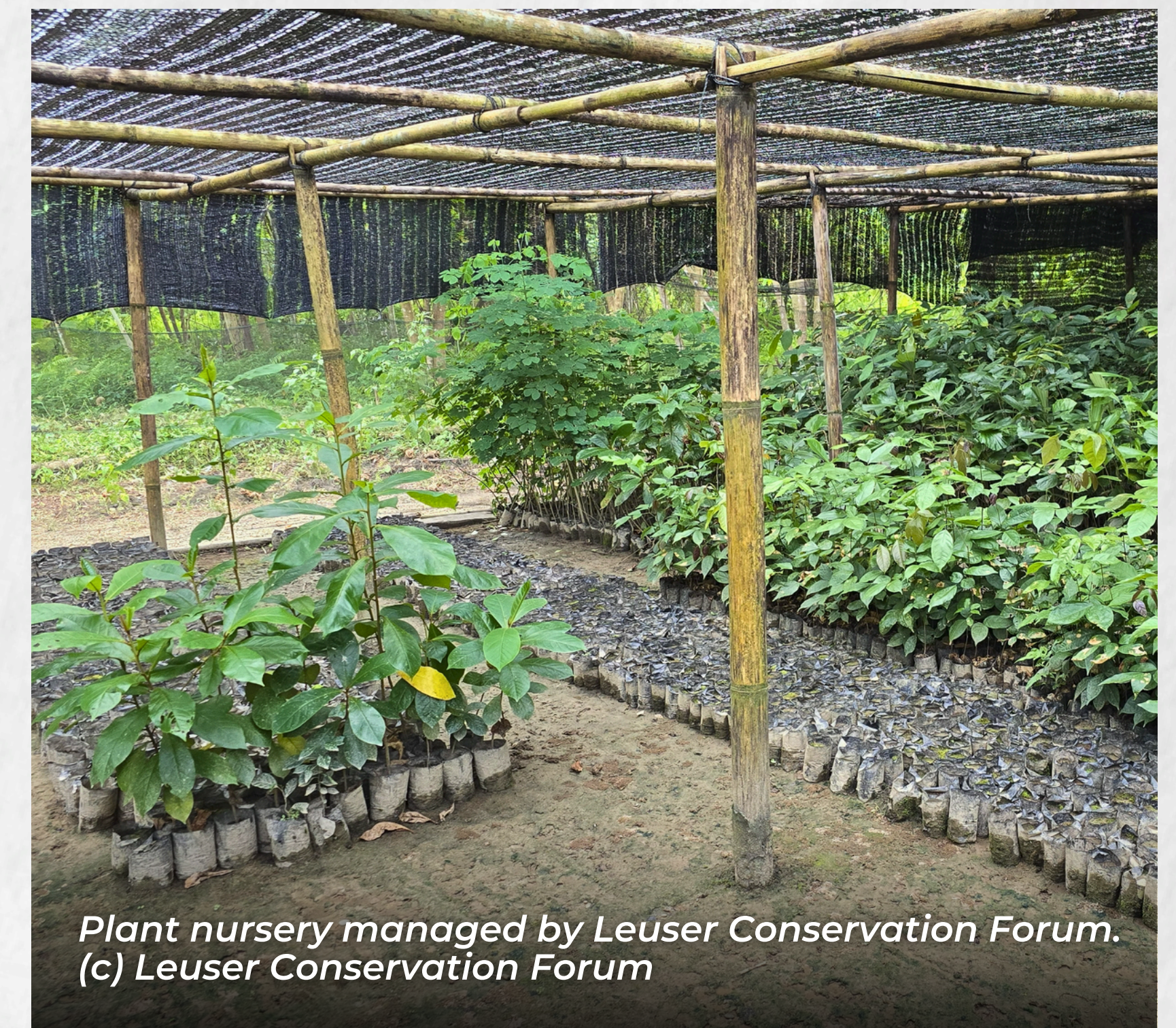
Plant nursery managed by Leuser Conservation Forum.

perilously close to extinction, the Leuser Conservation Forum (FKL) is implementing a comprehensive program to protect and grow the remaining population. With support from the Rhino Recovery Fund, FKL is expanding ranger programs, restoring degraded habitat areas, and promoting community education initiatives. This multifaceted approach aims to safeguard the Leuser Ecosystem as a functioning home for rhinos while building long-term local stewardship essential for the species' survival. Through the intensive protection of the Sumatran rhino, other endangered species have benefited, including Sumatran tigers, orangutans, and Asian elephants.